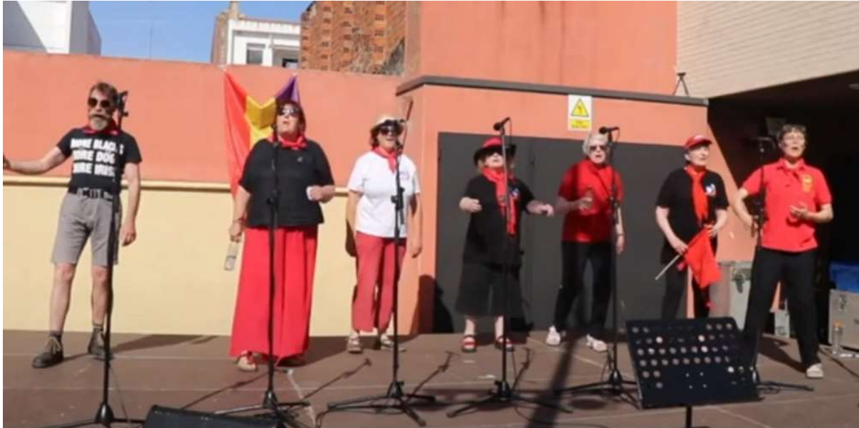
Above: The Red Kites at Malgrat de Mar representing the solidarity of the Oxford International Brigade Memorial Committee and the IBMT and all anti-fascists everywhere. Below: Another of the eleven choirs that sang at Malgrat

One choir, from Malmo in Sweden said they would like to come to Oxford to perform at our memorial at St Clements. Quite an honour and one to which we should extend welcome as soon as possible.